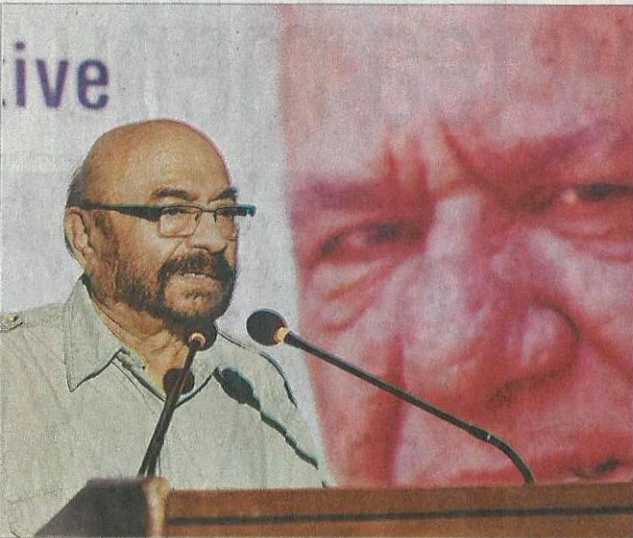
Director Govind Nihalani, who has worked with Om Puri in movies like Tamas , Aghaat and Droh Kaal , among others, paid a tribute to the actor at the Habitat Film Festival