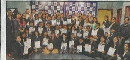
Ryan International School, Vasant Kunj

handling the camera. The students wrote scripts for special events such as Father's Day, Bahubali- The Conclusion, Indian Premier