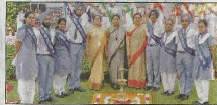
GTB 3rd Centenary Public School

singing numbers like sing, staying alive etc. In Sufiana category, Green House was adjudged the winner whereas in the western singing category Blue House bagged the first position.