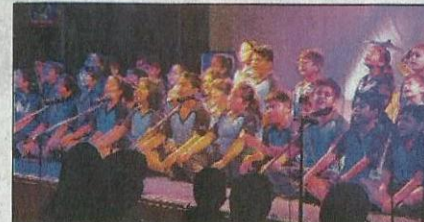
OPG World School, Dwarka

OPG World School, Dwarka organised an inter-house music competition 'Unison 2017.' The event saw students of classes IV to XII competing in various categories like 'Sufiana' group song competition, solo performances, western